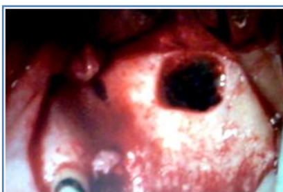
Fig. 2. Caldwell-luc operation image.